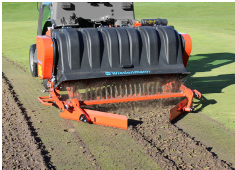
Swath board When using coring tines on the TERRA SPIKE® SL, the cores can automatically be aligned in the swath by means of the optional swath board. This considerably facilitates the subsequent take-up of the cores.

The high productivity of the TERRA SPIKE® SL will also convince you.